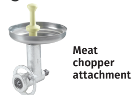
Meat chopper attachment

From 12 quarts to 140 quarts, there's a wide range of Hobart Legacy+ mixers with the capacity, capabilities and helpful accessories your kitchen needs.